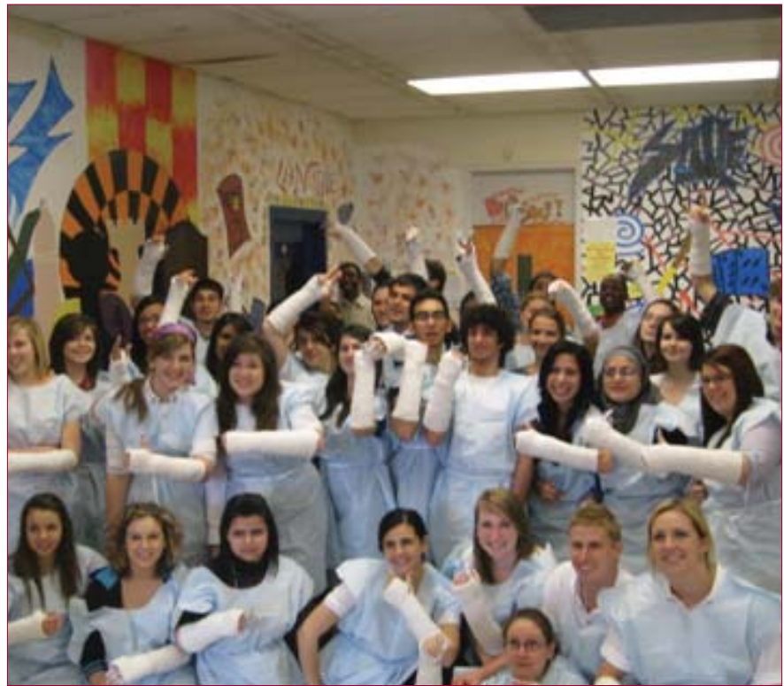
Students from Welland-area high schools at the cast workshop with medical students from the class of 2013

The activity would not have been possible without the energy and enthusiasm of the 11 Meds-2013 students and the participation of Dr. Antoine Gagnon, the physician in charge of the activity.